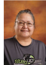
ARTISAN MARKET MARY CHIX WASHIAKIE

ENTERING: Monday, August 31.....11:00 am to 3:00 pm Tuesday, September 1.....9:00 am to 9:00 pm Wednesday, September 2.....9:00 am to 12:00 pm